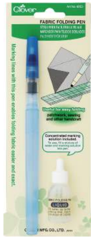
Item No. 4053