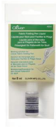
Item No. 4054