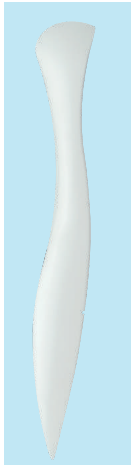
Point 2 Point Turner Item No. 7803

•Two points are available, one at either end of the tool. One is a sharp point that is perfect for tight, limited spaces like collar points. The other point is on the edge of the spatula shaped end. This is ideal for points with a little more access. The unique shape of this point allows you to approach the point from the side, pushing with the grain of the fabric. Pressing out in this manner with the grain helps you avoid stretching or distorting your fabric.