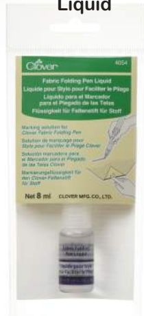
Item No. 4054