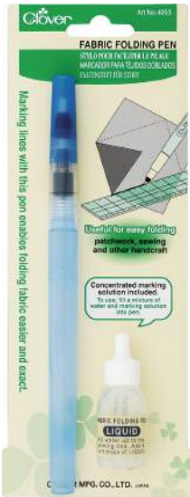
Item No. 4053