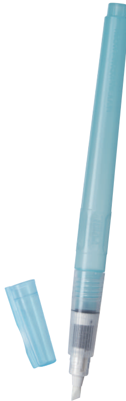
Item No. 4053

•Any crease or hem you want to form can be made very quickly with our without an iron. Use a straight edge to lay down the wet bead line and then simply fold over and finger press or iron. Even the most detailed designs can be accomplished. This is an especially useful tool when working with minimum seam allowances.