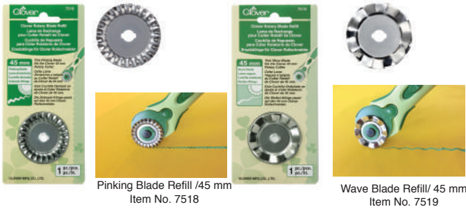
Pinking Blade Refill / 45 mm Item No. 7518