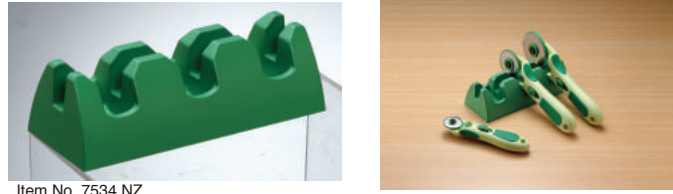
Item No. 7534 NZ