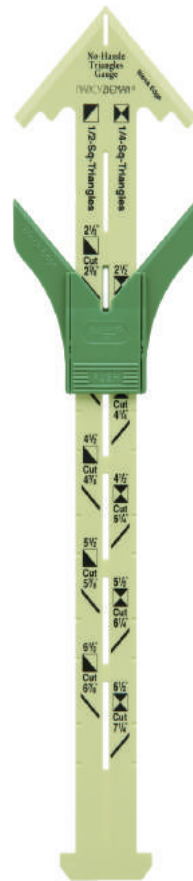
No-Hassle Triangles Gauge Item No. 9579

•For half square triangles you refer to the left side of the gauge. There you will find five different sizes of blocks. Reset the locking slide to the diagonal line below the size desired for your quilt design. The two numbers above will tell you what size to cut your blocks and what size the final triangle block will be. Once the blocks are cut, superimpose the triangle gauge within a double stacked block and mark the center line. Sew your scant quarter inch on either side of the marked line and then cut, unfold and press.