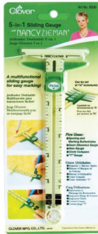
5-in-1 Sliding Gauge Item No. 9506 MSRP: $14.50