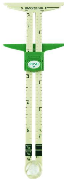
Item No. 9506

•Create perfect circles or arcs. The right side of the gauge is marked in inches from 0 at the pivot point up to 6 inches at the top. Hold the pivot point with Clover's awl and insert a marking pin into the locking cursor set at the desired radius and swing for a perfect arc or circle.